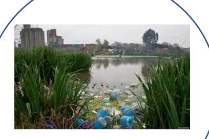
POLLUTANTS OF THE RIVER

The users of the river are the nearby households and facilities around the river. In 2019 the city environment office identified that around 56 establishments and more than 100 houses have contaminated the Bulacao River in Cebu City. Aside from the houses, they found that dressing plants, slaughterhouses and stores situated near the river may have contributed to its pollution. Water deposited at the Bulacao River comes from houses in Barangays Bulacao and Inayawan.